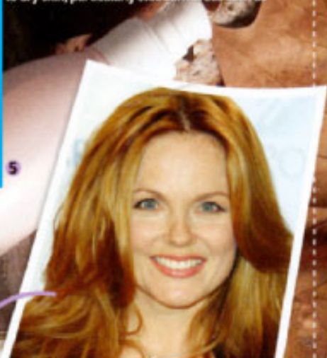
Geri HALLIWELL is a fan of The Organic Pharmacy products

skin types, this milk cleanser removes makeup and impurities – and all with a divine rose petal smell. 6. The Organic Pharmacy Ultra Dry Skin Cream, $115. Call 1300 553 440 This works quickly to restore skin to its former glory. Brings instant relief to dry skin, particularly stubborn areas such as